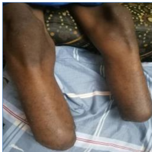
Figure 1: amputated limbs

Following clear demarcation of necrotic tissue, the orthopedic team proceeded with bilateral below-knee amputation (Figure 1). The patient subsequently underwent successful stoma reversal and is currently stable and doing well under follow-up.